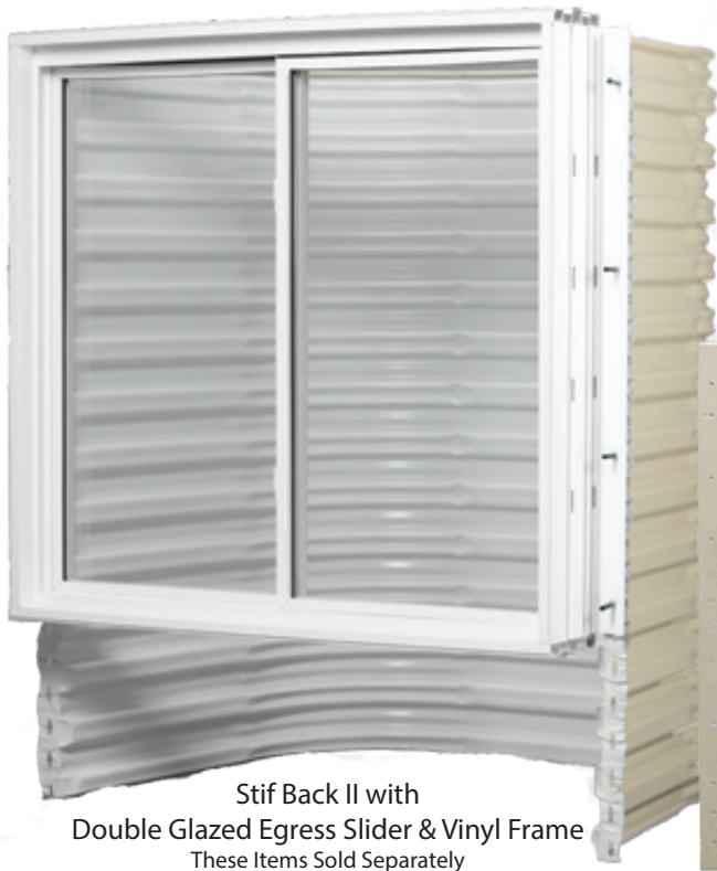
Stif Back II with Double Glazed Egress Slider & Vinyl Frame These Items Sold Separately