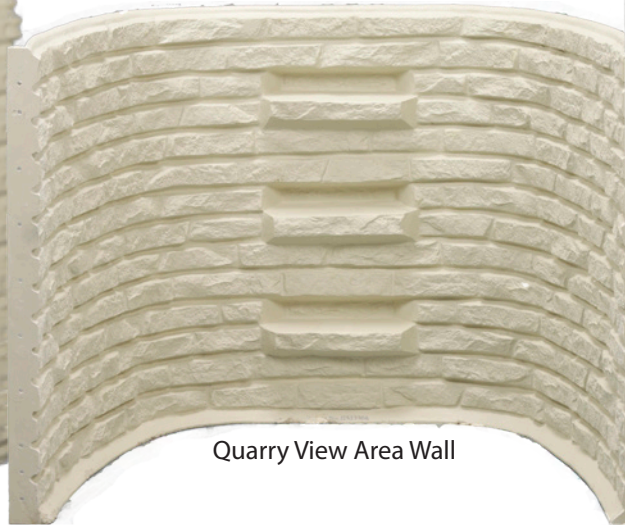
Quarry View Area Wall