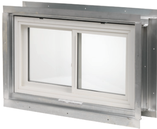
Window Buck Shown With Insulated White Vinyl Slider These Items Sold Separately