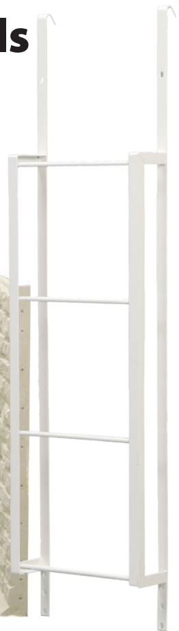
4 Rung Egress Ladder